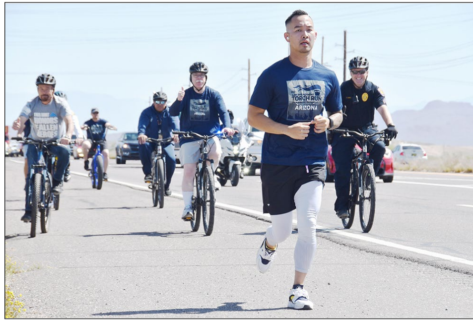
SRPD officers run their stretch of the annual Law Enforcement Torch Run along State Route 87 up to McDowell and Country Club roads.