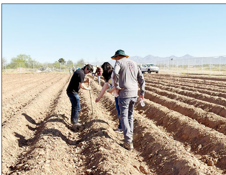
Staff from the Cultural Resources Department put their green thumb to use, by planting tepary beans at the Community Garden.