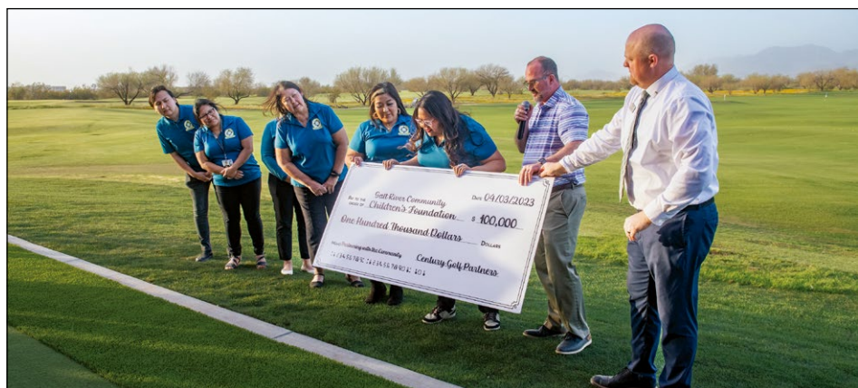
Members from the Salt River Children's Foundation receive a check donation from Century Golf Partners.