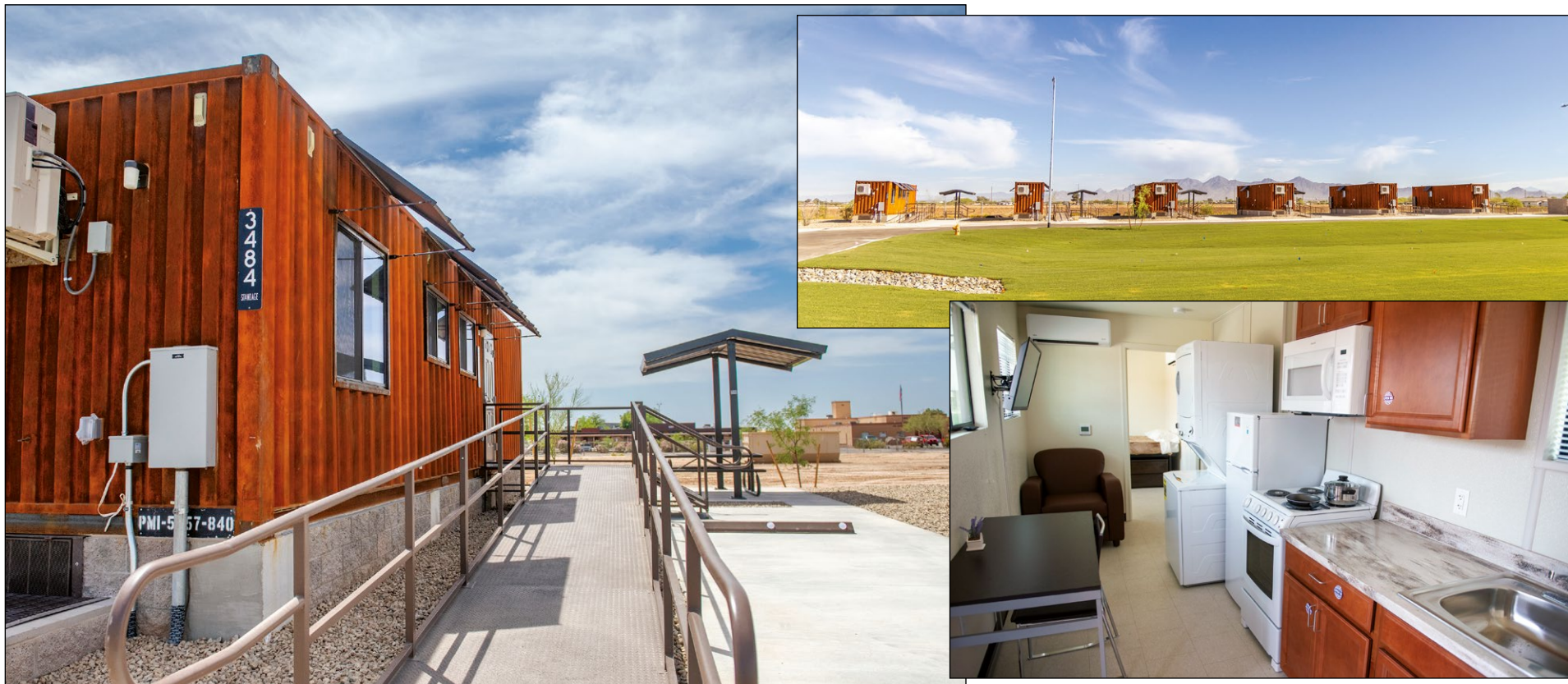
The transitional housing units are fully furnished inside and out with appliances and amenities that include a mailing address to receive correspondence. Top right photo, at the north end of the transitional housing complex, units are available for those exiting the corrections system, while units at the south end are for residents going through the Journey to Recovery program.

The STEP Committee includes five voting members (CDD/RS, ECS/Residential Services, HHS/Central Intake Center, HHS/JTR, HHS/SSP) and three ad hoc non-voting members (Human Resources, the Education Higher Ed Program and Social Services).