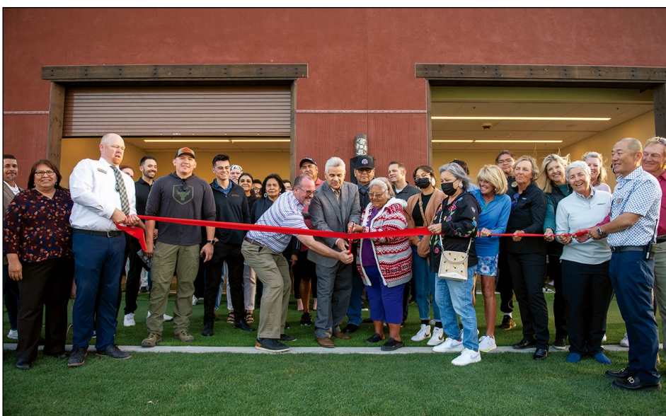
SRPMIC leadership and board members from MayDall Construction, landowners' team and TSGC management cut the ribbon on the new golf academy.