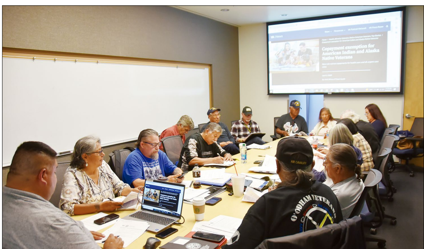
SRPMIC veterans met to discuss the recent changes to the health services and urgent care benefits unveiled by the Department of Veterans Affairs.

"The U.S. government has a unique responsibility to maintain trust and provide healthcare services to American Indians and Alaska Natives. Recent legislation extended the responsibility of providing care to American Indian and Alaska Native veterans to the Department of Veterans Affairs," the VA said