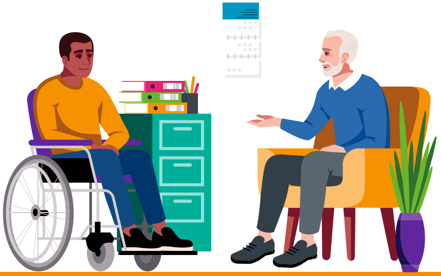
Services made possible through an ARPA grant from the City of Phoenix.